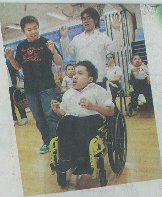
▲▼ Students with disabilities work hard during a rehearsal.